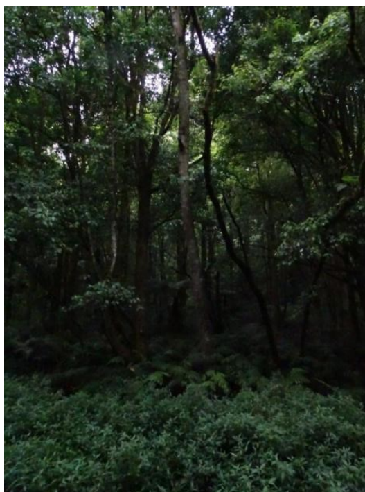
Figure 5. One of the Spots Inside the Batukahu Nature Reserve (The forest is still in good condition, and people penetration to the area is in the normal stage)

Candikuning) as a sign that they are the people of Candikuning Village. The socio-cultural conditions of the Bedugul people, both Hindus, and Moslems, still hold firm religious traditions, as evidenced by the increase of mosque constructions, the restoration of Hindu temples (Figure 6), and the many residents who attend these places of worship. For decades, Bedugul has become one of the central development points of Islam in Bali, marked by the establishment of several Islamic boarding schools (Figure 7), Islamic schools, and many mosque buildings (Vickers, 1987). Two different religious majority communities inhabit population growth in Bedugul; namely Islam and Hinduism. The Islamic community mainly shows a significant trend. This is inseparable from the philosophical thinking of Islam that having many children will be the agent of spreading their religion for the sustainability of Islam into the future. Thus, many of the previous generations of Bedugul Moslems allegedly did not follow National Family Planning Programs or use contraceptive tools. Besides, the process of acculturation of marriage within the other community, especially from Java and Lombok, has also further increased the growth of the Islamic community in Bedugul.