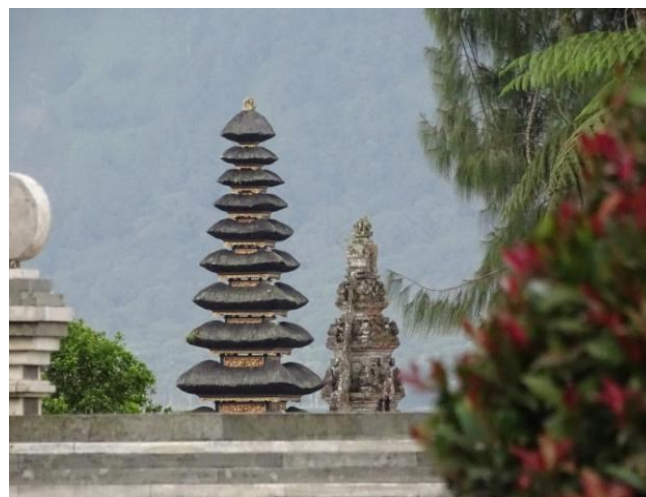
Figure 6. Balinese Hindu Temple (A good example on Balinese Hindu Temple looks like)

In today's modern era, very rarely citizens, especially the younger generation, understand the composition and plant material used to make Canang Sari, so many Bedugul people buy ready-made Canang Sari in traditional markets (Atmadja, Ariyani, & Atmadja, 2016). This occurs due to the busy lives of people within the community, and it is feared that the knowledge of how to make these offerings and sustainability of plant species used for Bali Hindus ceremonies will be lost. On the other hand, there are still a small number of Bedugul people who care about the preservation of ceremonial plants, by planting most of the plants used in ceremonies around their homes and yards. This group usually works as handymen (makers of Balinese Hindu ceremonial facilities), although there are also some common people who plant ceremonial plants and know how to make and prepare Canang Sari instead of buying them.