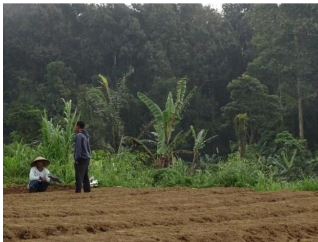
Figure 3. Horticultural Lands (Two farmers talked each other about their experience on how to keep their crops successful)

In the process of cultivating horticultural crops (Figure 3), it cannot be separated from the fertilization and pest control. Until now, almost all Bedugul farmers use inorganic fertilizers in high doses. Consumers fear that products from this area are not organic and thus can endanger their health. In addition to the overuse of fertilizing, pest management also uses the high doses of inorganic chemicals. Environmental changes in Bedugul area and the increasing population growth have resulted in the carrying capacity of the catchment area becoming very vulnerable, and one of them is the emergence of pest species. Pest control becomes an obligation for farmers to keep their crops successful, although it can increase the negative environmental impacts that may arise in the future (Ratnasari, Siaka, & Suastuti, 2013).