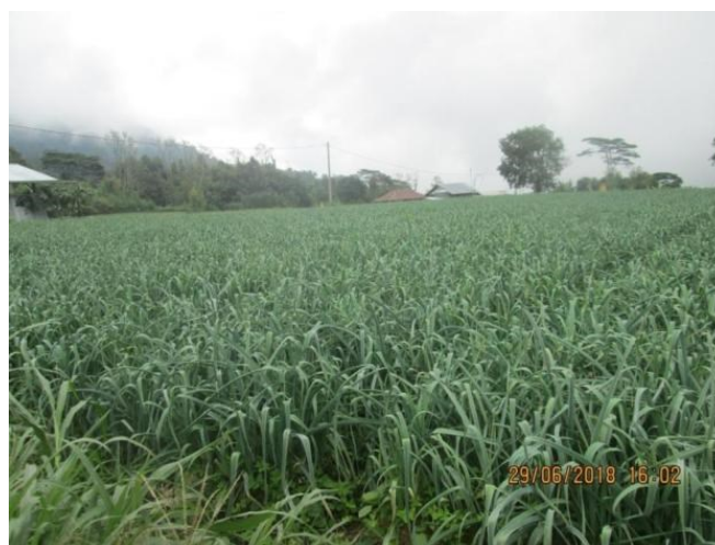
Figure 2. Leek ( Allium ampeloprasum L. ) (One of the main horticultural products in Bedugul and many Bedugul farmers rely heavily on this product)