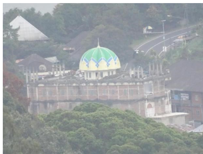
Figure 7. Islamic Boarding School (One of the Arabic language learning centers in Bali island)