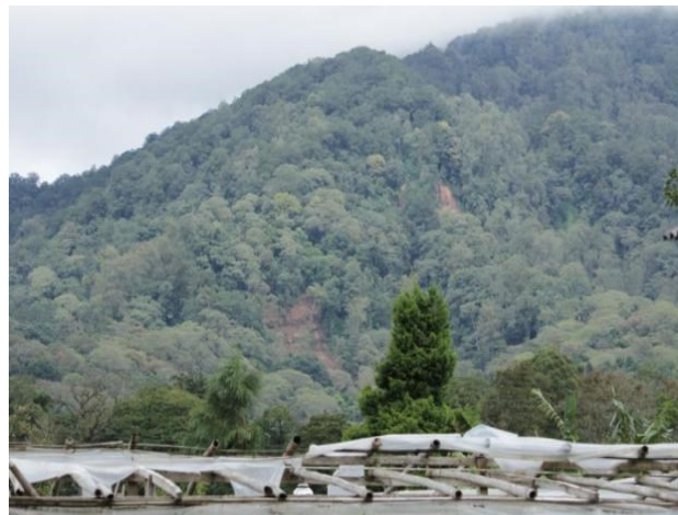
Figure 9. Landslides in 2017 (Landslides are a major risk in many parts of Bali, including Bedugul, during the rainy season)