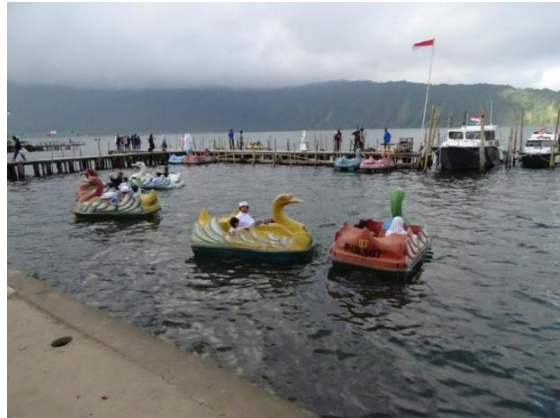
Figure 8. Tourist Attractions (Speed Boats and Banana Boats) (Speed boats and banana boats may generate a good income, but at the same time result in water pollution, i.e., fuel spills)

period (As-syakur, 2007). Landslides and flash floods also occurred previously in 1967, which was a period that was also believed to be a wet season.