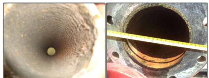
Figure 1. Internal Pipe Condition 3" and 6"

As shown from Figure 1, internal pipes are still in a good condition. General corrosion occurred on the pipe internal surface slightly. A very thin scale layer was found along the surface area. There was no deposit found that could reduce flow rate of fire water.