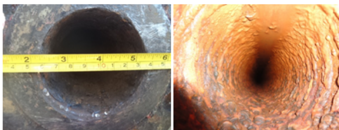
Figure 3. Internal Pipe Condition 3" and 6"

Visual inspections was conducted to pipes with diameter 4" and 6". The conditions of internal pipes are shown by Figure 3.