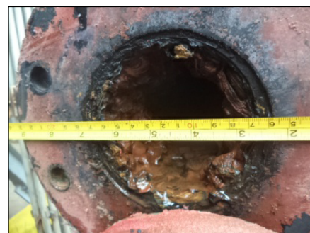
Figure 4. 4" Pipe Internal Condition

Visual inspection was conducted to pipe with diameter 4". The condition of internal pipeis shown by Figure 4.