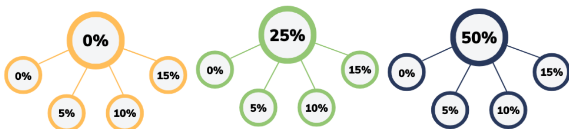
Figure 1. Presentation of the 12 tested scenarios

After data collection, scenario configurations were performed. These take into account the degree of use of disposable cups, loss or misplacement of the cups provided (requiring replacement), and amount to 12 scenarios, as shown in Figure 1.