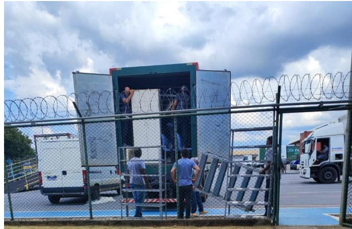
Figure 11. Furniture donated to IFSULDEMINAS.