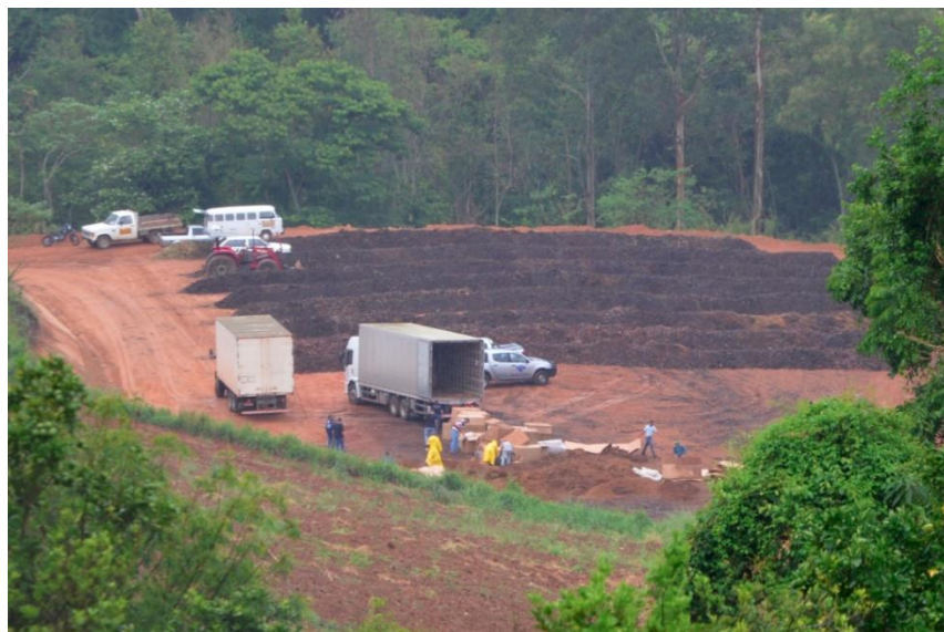
Figure 4. Production of organic compost at Campus Muzambinho.

Campus Muzambinho created an ecologically correct disposal method, using composting to transform tobacco from seized cigarettes into organic fertilizer, combined with animal waste and gardening leftovers from its agricultural and zootechnical laboratories. Annually, these laboratories produce 270 m 3 of animal waste and 400 m 3 of gardening waste, which serve as the basis for organic compost. This composting process, enhanced to use 65% tobacco, 5% food supplement and 30% animal waste, results in nutrient-rich material, benefiting the school's crops and local farmers.