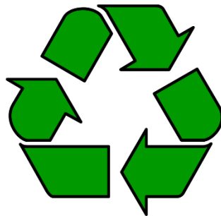
Figure 3. The Universal Recycling Symbol [9].

The 5 R's policy is a strategy to reduce the environmental impact related to consumption and waste management. The five R's are: Reduce, Rethink, Reuse, Recycle and Refuse to consume products that generate significant socio-environmental impacts [4].