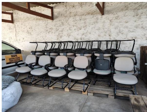
Figure 10. Armchairs donated to IFSULDEMINAS.

The search for material takes place by moving a truck, van, or other official vehicle, depending on the volume of material to be transported and logistical availability.