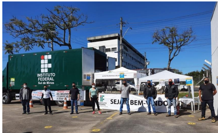
Figure 15. IFSULDEMINAS team during distribution of alcohol gel to the population during the Coronavirus Pandemic.

The aromatic material is kept separate and sealed to preserve its characteristics until dilution and mixing in the final production process.