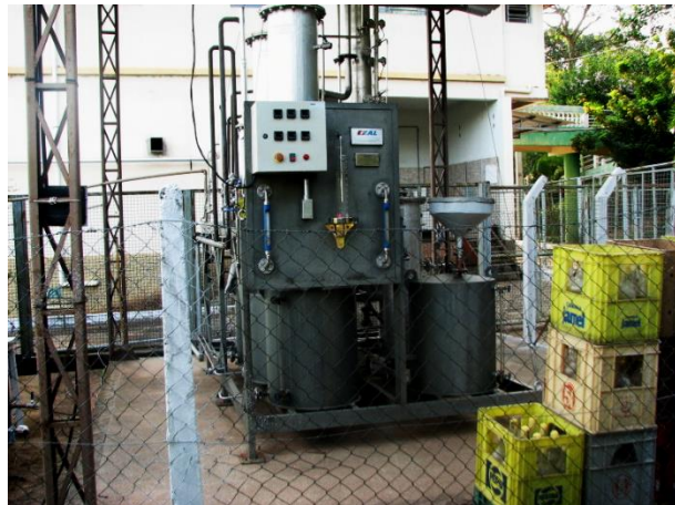
Figure 13. Alcohol processing tower at Campus Inconfidentes.

levels in the region, the original demand for liquid and gel alcohol decreased. This material continues to be produced and sent for use in cleaning and disinfection both internally at IFSULDEMINAS and in registered NGOs and APACs.