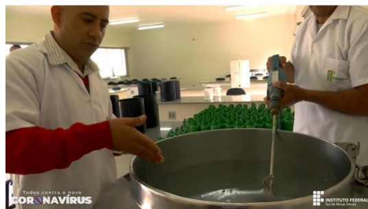
Figure 12. Manufacture of alcohol gel at Campus Inconfidentes.

To meet this immeasurable demand for material, the technical staff at Campus Inconfidentes set out to develop a way to process raw materials rich in alcohol content and produce alcohol, in liquid and gel form, with sufficient quality for hand disinfection and surfaces.