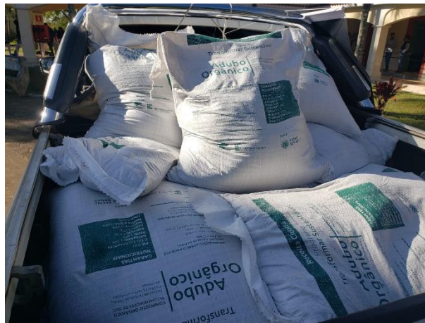
Figure 5. Bagged organic compost for donation.

The logistics of the composting program involve collecting organic material from the agricultural campus, tobacco from processed cigarettes in Belo Horizonte and food supplements dispersed throughout the country, with greater complexity in collecting the latter. Transport is carried out mainly by IFSULDEMINAS trucks. Compost production requires a significant staff, including a coordinator to manage inventories and labor, student scholars for analysis and documentation of the material, and workers for handling and processing in the field, including moving and monitoring the compost. Furthermore, itinerant labor, made up mainly of inmates from Pouso Alegre, is used to mischaracterize the food supplement, with the aim of resocializing and advancing the sentences of those involved.