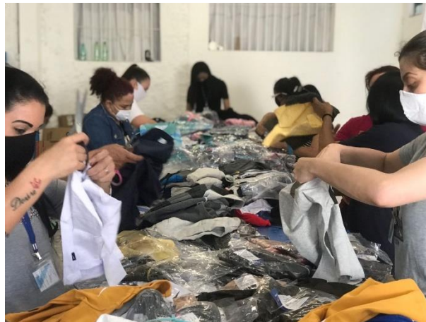
Figure 8. Clothing mischaracterization by inmates recovering at APAC in Pouso Alegre.

that have counterfeit brands or are involved in tax evasion includes removing logos and other identifying details from brands through techniques such as sanding, abrading, cutting, and even painting over the logos to hide them.