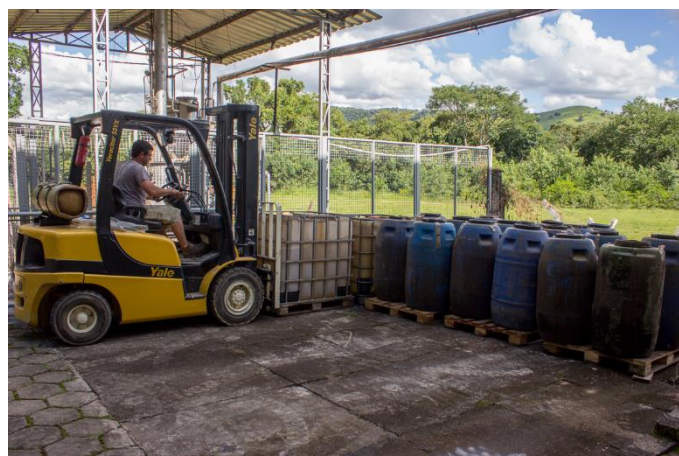
Figure 14. Stock of drinks seized by the RFB donated to IFSULDEMINAS.

In a second phase of the program, there was a new formulation for the production of room odorizers. This material uses alcohol-based raw materials, which makes it an efficient cleaning product intended for disinfection, and has an aromatic base. These aromas can originate from perfumes, normally seized due to illegal imports and tax evasion, or can also be obtained through aromatic essences normally destined for electronic cigarettes.