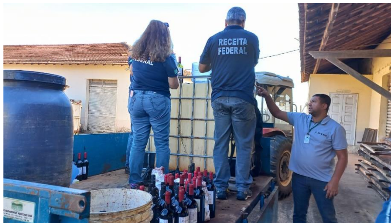
Figure 7. Delivery of wine cargo seized by the RFB.