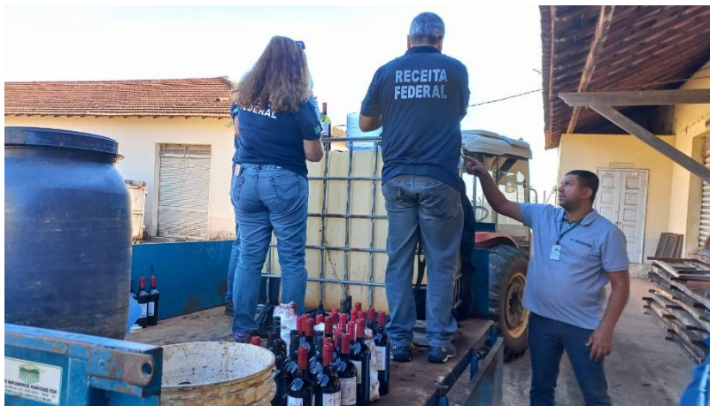
Figure 7. Delivery of wine cargo seized by the RFB.