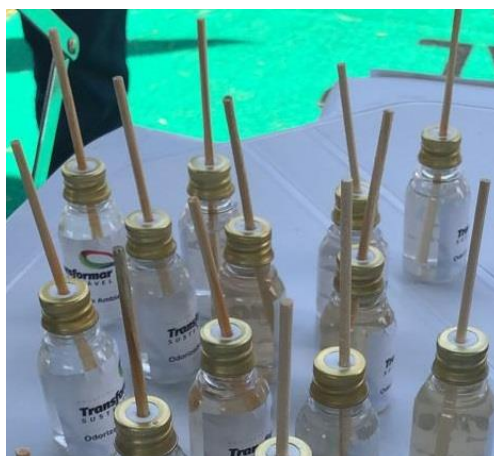
Figure 16. Odorizers produced with the essence of electronic cigarettes seized by the RFB.

Waste, including glass, plastic and cardboard, is sent to recycling cooperatives for environmentally friendly disposal.