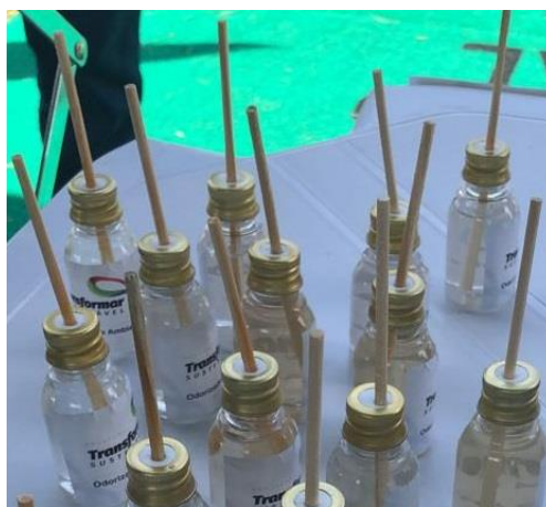
Figure 16. Odorizers produced with the essence of electronic cigarettes seized by the RFB.

Waste, including glass, plastic and cardboard, is sent to recycling cooperatives for environmentally friendly disposal.