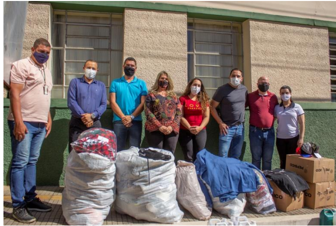
Figure 9. Donation of mismatched clothes to the city hall and parish of Inconfidentes.