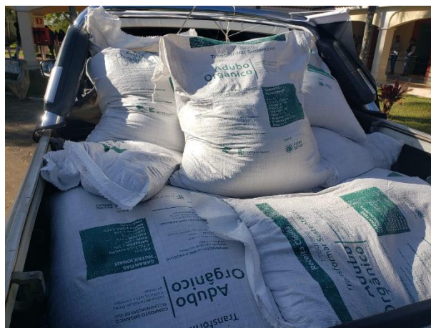
Figure 5. Bagged organic compost for donation.

The logistics of the composting program involve collecting organic material from the agricultural campus, tobacco from processed cigarettes in Belo Horizonte and food supplements dispersed throughout the country, with greater complexity in collecting the latter. Transport is carried out mainly by IFSULDEMINAS trucks. Compost production requires a significant staff, including a coordinator to manage inventories and labor, student scholars for analysis and documentation of the material, and workers for handling and processing in the field, including moving and monitoring the compost. Furthermore, itinerant labor, made up mainly of inmates from Pouso Alegre, is used to mischaracterize the food supplement, with the aim of resocializing and advancing the sentences of those involved.