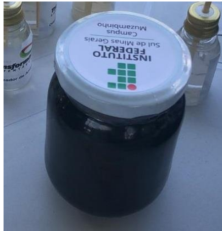
Figure 6. Wine jelly manufactured by Campus Muzambinho.

formula used for production according to the improvement provided by the various tests carried out. The product will be made through a partnership with the Campus Muzambinho cooperative, which will be responsible for the production, packaging and storage of the product until its final destination.