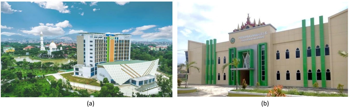
Figure 1. (a.) Main Campus (b.) Postgraduate Campus

UIN Raden Intan Lampung located in the suburban area of Sukarame, Bandar Lampung, the capital city of Lampung Province. This strategic location provides a blend of urban amenities and a serene atmosphere, ideal for academic pursuits. The campus is surrounded by community housing and expansive green open spaces, contributing to a peaceful and conducive learning environment.