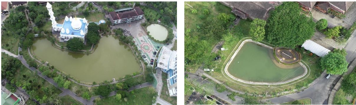
Figure 3. Artificial Pond for Water Conservation

The strategic placement of these ponds allows for the collection and storage of rainwater, which can be utilized during periods of low precipitation, thus supporting the campus's sustainability efforts (Santos et al., 2021). Furthermore, the integration of such water conservation measures aligns with broader sustainability initiatives observed in various educational institutions worldwide, which aim to promote responsible water management and environmental stewardship (Zhao & Zou, 2015; Zou et al., 2015; Kostoulas-Makrakis & Makrakis, 2012). Moreover, the benefits of artificial ponds extend beyond mere water storage; they also contribute to biodiversity conservation and ecosystem resilience. Research indicates that these ponds can enhance habitat connectivity and support various aquatic species, thereby playing a crucial role in maintaining ecological balance in modified landscapes (Santos et al., 2021; Briggs et al., 2019). By fostering biodiversity, these artificial ponds not only serve immediate practical needs but also contribute to long-term ecological health, which is essential in the face of ongoing climate challenges (Santos et al., 2021; Briggs et al., 2019).