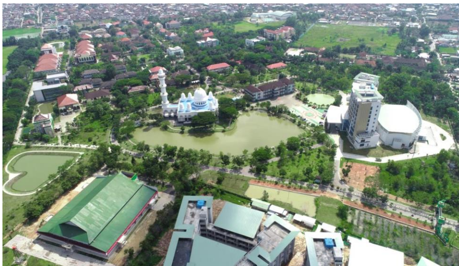
Figure 2. A picturesque Scenery of Main Campus

The campus has a remarkable open space ratio of 81.72%, which plays a crucial role in addressing climate change issues. This extensive open space helps mitigate the urban heat island effect by reducing surface temperatures, which in turn lowers the demand for energy-intensive air conditioning. The abundant greenery acts as a carbon sink, absorbing carbon dioxide and releasing oxygen, thereby contributing to the reduction of greenhouse gases in the atmosphere. Furthermore, these open green spaces enhance biodiversity by providing habitats for various plant and animal species, promoting a balanced ecosystem. The large proportion of open space also improves water management on campus, allowing for better absorption of rainwater and reducing the risk of flooding, which is increasingly important in the face of unpredictable weather patterns due to climate change.