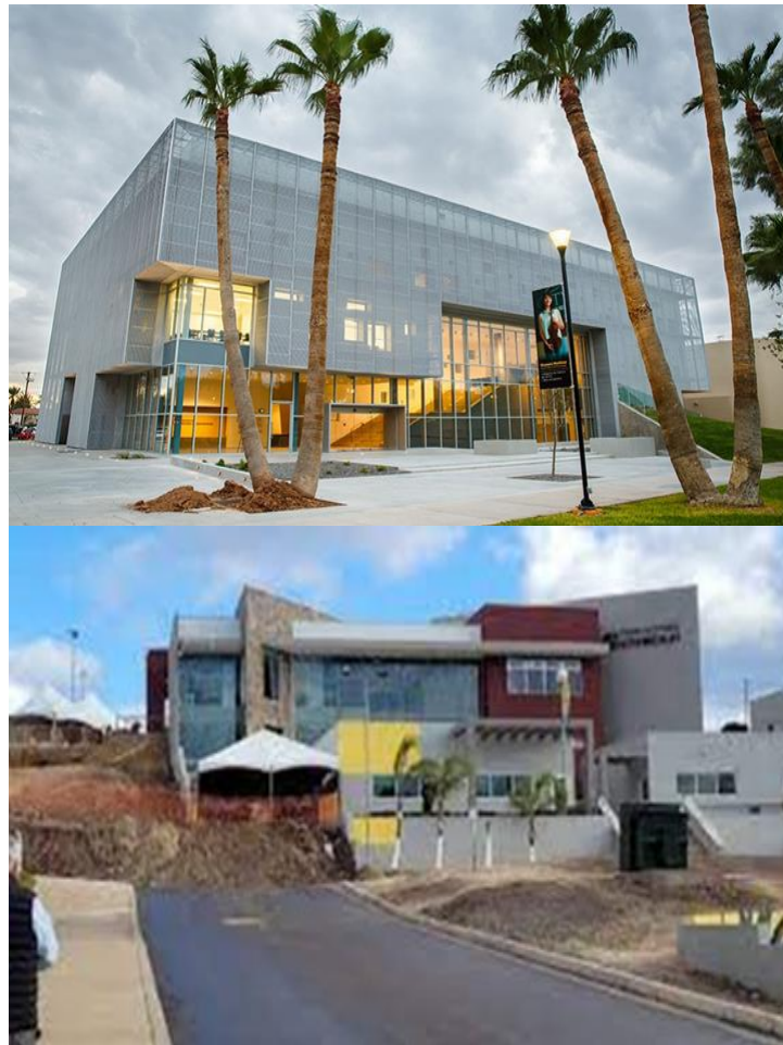
Figure 1. Research center CECE at CETYS Mexicali. Sustainable building skin for energy efficiency (top) and Center for Wine Studies (CEVIT) at CETYS Ensenada. The use of large windows allows more natural light and regulates internal temperature (bottom).

Waste management has at least five types of impacts on climate change, attributable to (1) landfill methane emissions; (2) reduction in industrial energy use and emissions due to recycling and waste reduction; (3) energy recovery from waste; (4) carbon sequestration in forests due to decreased demand for virgin paper; and (5) energy used in long-distance transport of waste [7]. The CETYS program “Zero Waste” fully implemented at Campus Tijuana has had excellent results. Not only with the reduction of internal waste sent to the landfill, the separation, composting, and recycling of waste but also by the campaigns carried out with the community surrounding CETYS. The program managed to reduce the amount of waste deposited in landfills by 68%, with the consequent impact on the reduction of emissions into the atmosphere. Table 1 shows the historical results of the program.