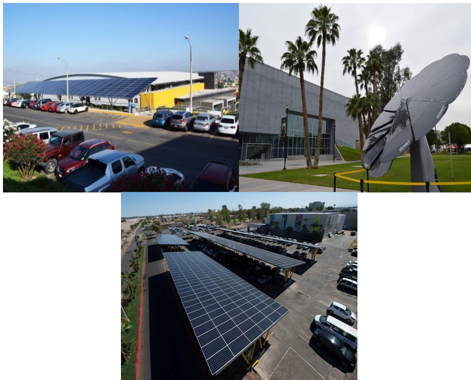
Figure 4. CETYS “Solar Power” program and facilities.

The CETYS internal policy for carbon neutrality (under review with the President’s staff and academic authorities), as a part of the strategic plan CETYS-2036, seeks the progressive decrease of Green House Emissions (GHE), to attain 80% of reduction by the year 2040 to 2045. The economic implications associated with this policy have been taken very seriously by the university's senior management so that it is a realistic and achievable plan with the metrics and times established therein. Due to the high mobility of students and teachers at the institution (internationalization is a pillar of education at CETYS), the plan contemplates the reduction of emissions from scope 1, 2 and 3. The Action Plan will be announced during the second semester of 2024, and seeks to achieve carbon neutrality in the institution by 2045.