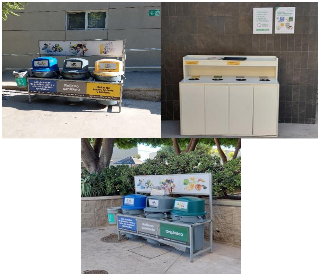
Figure 2. Containers for waste separation from the Zero Waste program.

CETYS community that the success of campaigns like these depends strongly on a series of actions that involve the community and that are implemented in a bidirectional top-bottom, bottom-top manner (Figure 2 shows some facilities of the Zero Waste program).