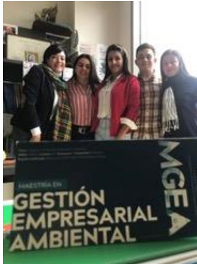
Students at El Bosque University: Students, strengthening culture and territories. Arauca – Colombia.