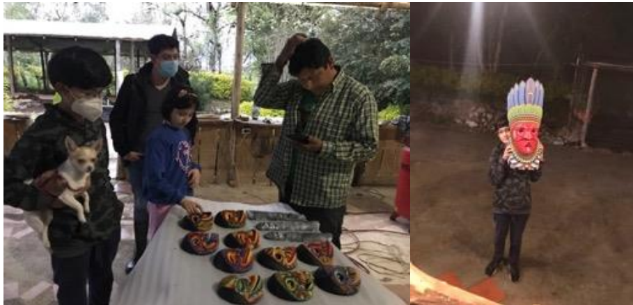
Rico, M. 2023. Ethnoeducation and Culture. Kamëntzä Culture. Sibundoy – Alto Putumayo- Colombia.

Culture and the environment are fundamental pillars in the new educational model, thus the configuration of the space called territory breaks the barriers and launches itself into a strong challenge of crossing borders, allowing new intercultural synergies with awareness of uses, resources and new technologies. With which it is counted, giving way to new world scenarios that resignify what inhabited and meant education in culture.