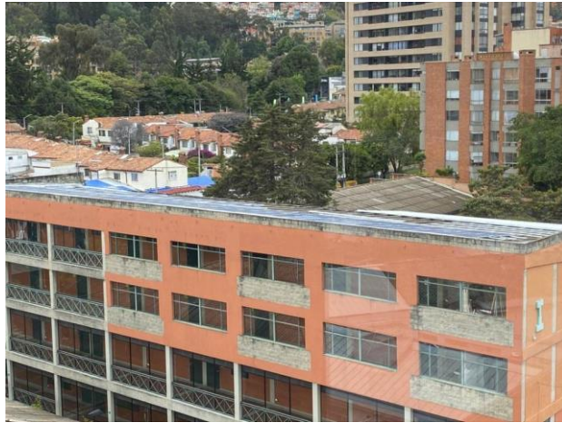
Figure 3. Installed solar panels