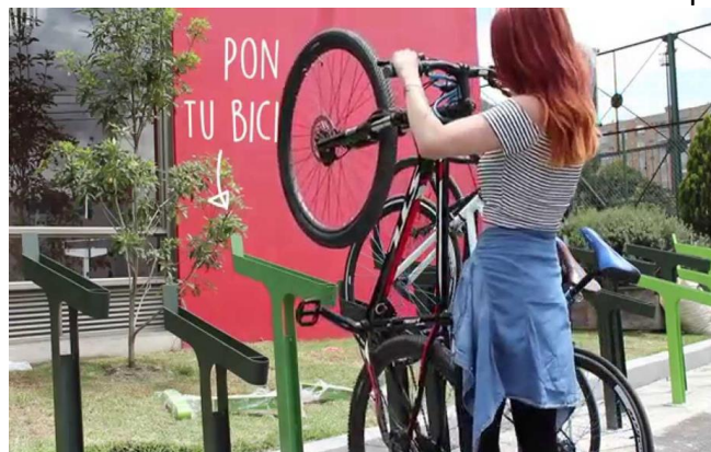
Figure 4. Bike racks of the institution

The implementation of the bike racks within the institution is part of the Universidad El Bosque's "moviéndonos" program, which has been in charge of managing the operation of this space, maintaining monthly reports on bicycle rotation, accidents and requests from the community, responding to these through communication actions. The program has generated a positive impact by promoting the use of bicycles as an alternative and sustainable means of transportation.