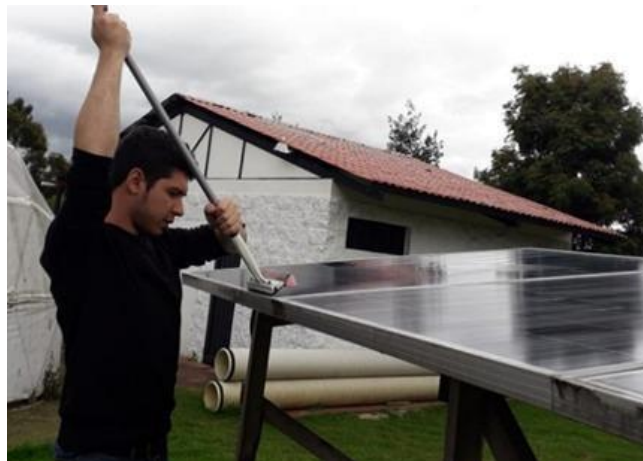
Figure 2. Installation of solar panels

This technology was ideal for generating energy with renewable sources on a small and medium scale and for own use. With the implementation of 1227 solar panels, the environmental impact was reduced by 79.2 tons of CO2 per year. In the long term, it was possible to use this as a strong marketing tool, showing its vocation as an entity committed to the environment.