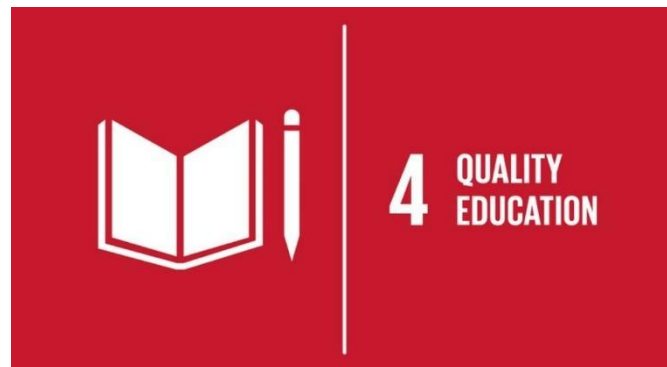
Figure 2. SDG 4 “Quality Education”

The statistics show the poor situation which influences in a negative way to the core objectives and tasks of the SDG 4. That is why, the SDG 4 remains the one of the important SDGs during the coronavirus pandemic.