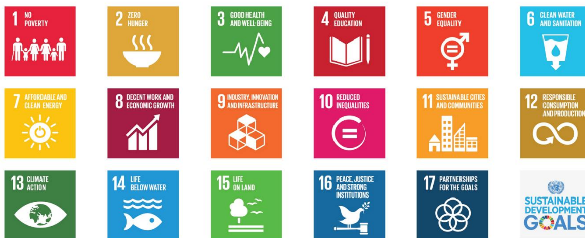
Figure 1. Sustainable Development Goals

This goal came about through an intensive consultative process led by Member-States, but with broad participation from civil society, teachers, unions, bilateral agencies, regional organizations, the private sector and research institutes and foundations.