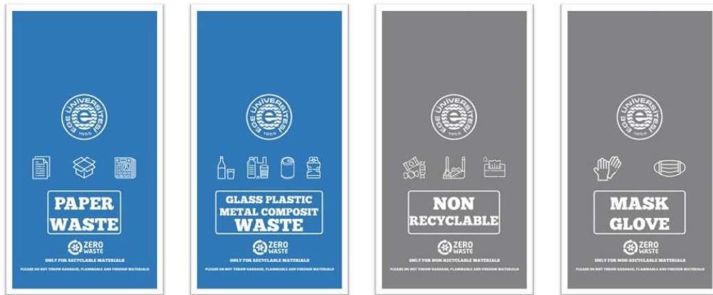
Figure 2. Packaging waste management during COVID-19 Pandemic