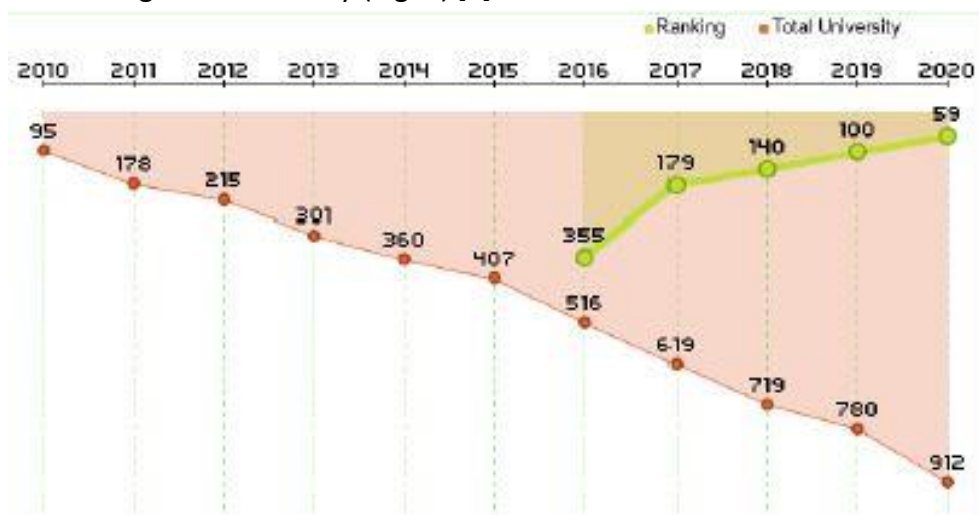
Figure 2. Positions of University of Pécs in the UI GreenMetric World University Rankings

The UP joined the UI GreenMetric World University Rankings in 2016, announcing the Green University Program. Thanks to the university's increasingly conscious sustainability aspirations and achievements, the UP in 2020 ranked 59 th in the forefront of the world's "green universities", while it ranked 1 st among Hungarian universities, earning the title of the greenest Hungarian university (Fig. 2) [4].