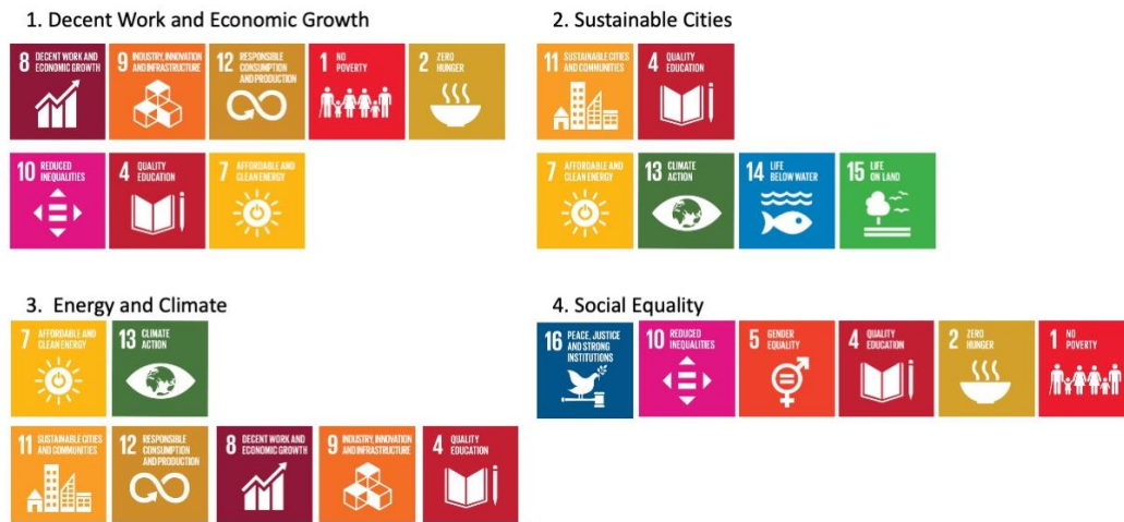
Figure 2. OzU Sustainability Clusters

The cluster structure is employed in essence to foster interdisciplinary initiatives. As Figure 1 illustrates all the SDGs are related with each other. Therefore, none of them can be tackled in isolation from the others. The analysis led to the clustering of the most interconnected SDGs with each other hence fostering interdisciplinary action. Moreover, the clusters themselves are not isolated from each other. Inter-cluster actions e.g. projects, research, etc. are highly sought after. As a matter of fact, cluster coordinators meet on a regular basis to both disseminate knowledge and identify and seize potential inter-cluster collaborations. Last but not least, SDGs under clusters are not static. This fluent structure allows the clusters to adopt to the changes that might occur in the SD landscape.