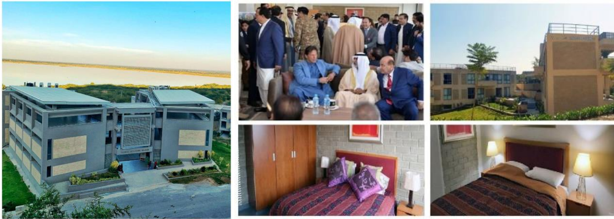
Figure 3: New academic block (on the left) and Sir Anwar Pervez Residency (on right and center) constructed using environment-friendly material.

Namal Institute has applied for the Leeds Consultant Certification, and it is under process. Institute hopes to achieve a platinum certificate by the consultants. Otherwise, the buildings are fully ventilated, open to natural light, and full of greenery. The buildings are enveloped by breathtaking sights of the exquisite Namal Valley overlooking the Namal Lake, aiming to become a hub of pioneering academic excellence.