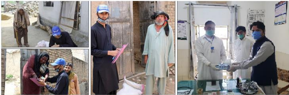
Figure 4: COVID-19 Initiatives taken by NSSI (on right and Center) and administrative staff (on the left).