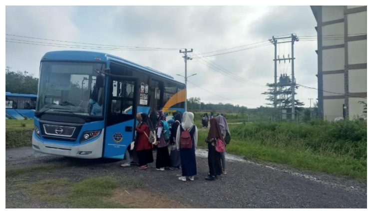
Figure 1. Smart BRT ITERA

The planned range of Smart BRT ITERA services can be seen in Figure 2. Route 1 includes, ITERA - Way Kandis (green): Jalan Terusan Ryacudu – Jalan Pangeran Suhaimi – Jalan Airan Raya – Jalan Ratu Dibalau – Jalan Lintas Sumatera – Jalan Ryacudu – Jalan Pangeran Suhaimi – Jalan Terusan Ryacudu; and for Route 2 includes, ITERA - UIN (orange): Jalan Terusan Ryacudu - Jalan Pangeran Suhaimi – Jalan Sultan Agung – Jalan Letjen Alamsyah Ratu Prawiranegara – Jalan Urip Sumoharjo – Jalan Endro Suratmin – Jalan Pangeran Senopati Raya – Jalan terusan Ryacudu.