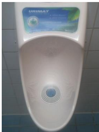
A. Waterless urinals

At the ECB, the installed water flushed urinals are replaced step by step by waterless urinals. This saves money and reduces the environmental impacts. At the moment about 60% have been replaced and more are added every year. The waterless systems are particularly attractive for regions with water shortages and high-water costs. The positive social effects should not remain unmentioned, because waterless urinal systems work more hygienically than conventional systems: The surface contamination by bacteria and mold is only a fraction of that of water-flushed urinals. The comparison of optics and smell nuisance of frequently frequented urinal systems precipitates clearly in favor of the waterless system. In addition, the cleaning personnel is relieved. For the remaining urinals and the toilets collected rainwater is used (see chapter 4.2) which is generally sufficient to cover a significant share of the water demand of toilets at ECB