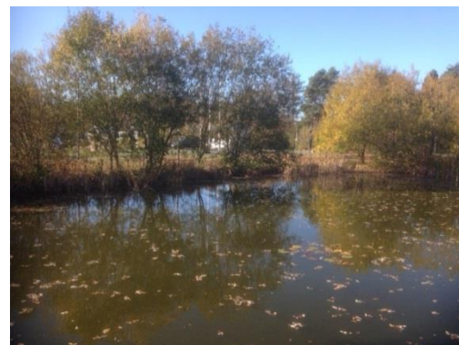
B. Rainwater collection pond and retention basin