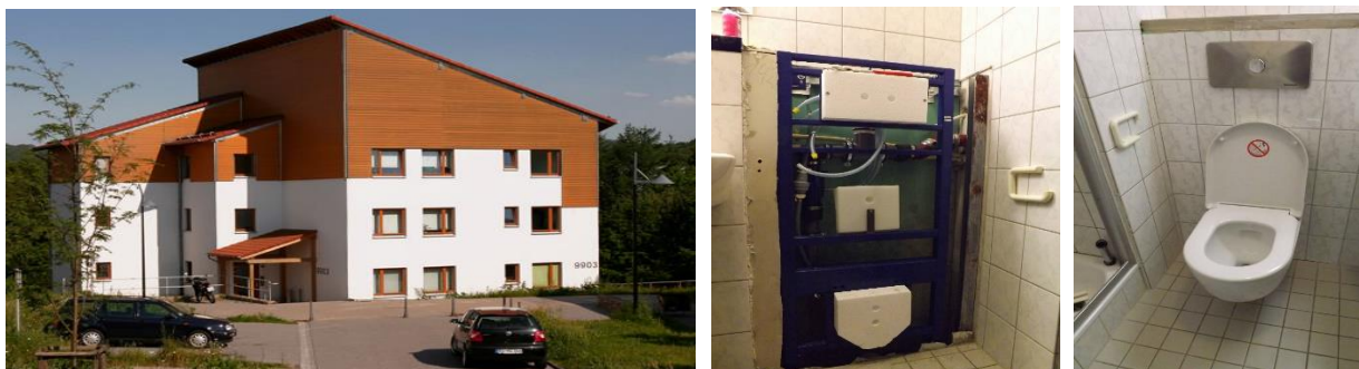
Figure 4. Project dormitory and installation of vacuum pre-wall system and vacuum toilet

For this purpose, an existing dormitory at the ECB was converted (see Fig. 4) in such a way that the separate collection and discharge of the partial streams grey and black water is possible. A total of 24 residential units (14 toilets / 14 showers / 3 kitchenettes) were converted within the 3-year project duration. First of all, all existing flush toilets were replaced with vacuum toilets. In order to enable a comparison of the conversion procedures, two approaches were taken into account for the subsequent separate collection of the grey and black water partial flows. For some of the residential units (7 showers, 7 toilets, 7 hand basin and 3 kitchenettes), a second pipe was installed in spring 2019, in which black water is drained off by means of negative pressure. For the second part of the residential units (6 showers, 6 toilets and 6 hand basin) an inversion of the existing downpipe was carried out in autumn 2019.