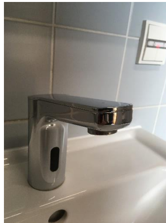
B. High-efficient faucets