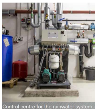
A. Rainwater harvesting system

ECB's water recycling program for rainwater is fully implemented. To relieve the burden on fresh water sources, the campus promotes the collection of rainwater. With the help of the 2,000 m 2 roof areas of the campus buildings, large amounts of rainfall can be collected and used in succession. The campus has a sophisticated rainwater collection and storage system (see Fig. 3) and thus uses the rainwater as a raw material for building services. The rainwater is conducted into two underground tanks, which have a combined capacity of 40 m 3 .