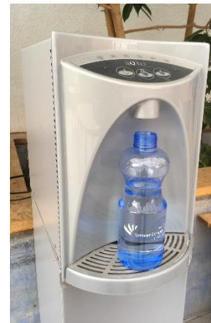
C. Water Dispenser