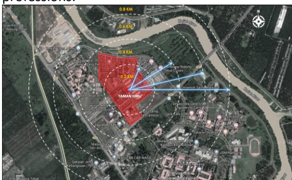
Figure 1. Map of Taman Ilmu, Nibong Tebal

The participants were selected voluntarily during the public invitation for involvement across the community forum via WhatsApp Group. The conditions for inclusion are (1) a mother whose children attended the primary school and (2) a resident of Taman Ilmu. A total of nine (9) participants have participated voluntarily in the FGD and the participation numbers are limited due to the pandemic Covid-19 crisis recently. Nonetheless, to ensure the validity of the data, all participants were chosen from different backgrounds of household income and professions.