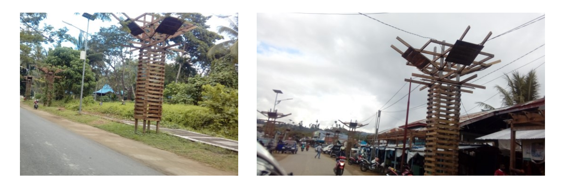
Figure 9. Super tree conditions

Pedestrian ways on Fundar Sakela Road use wooden board floor finishing with pergola variations on its vertical side. In addition, there are wooden sculptures called "super tree" (Figure 9). Super Tree is intended to "create" trees in a short period of time by growing vines in the sculpture so that over time the plants will reach the entire sculpture and seem like a tree. Unfortunately, almost all of these concepts were not successfully applied, due to a lack maintenance. This was also due to too many super trees being made, thus the maintenance became impractical and the trees were neglected.