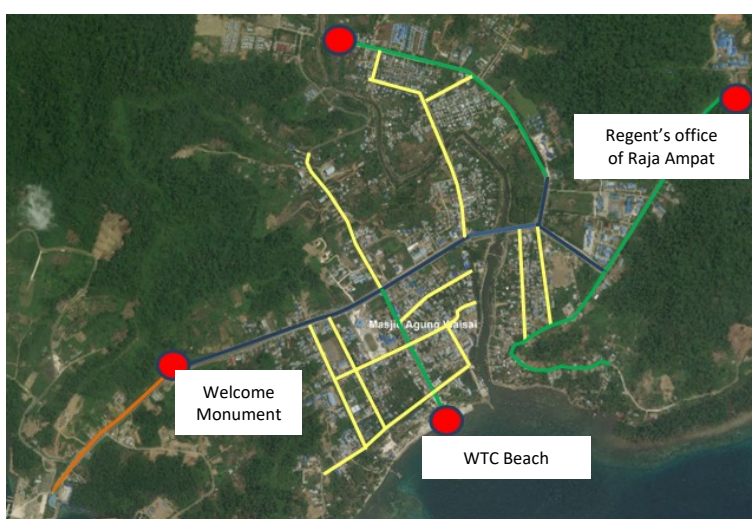
Figure 5. Waisai District Location