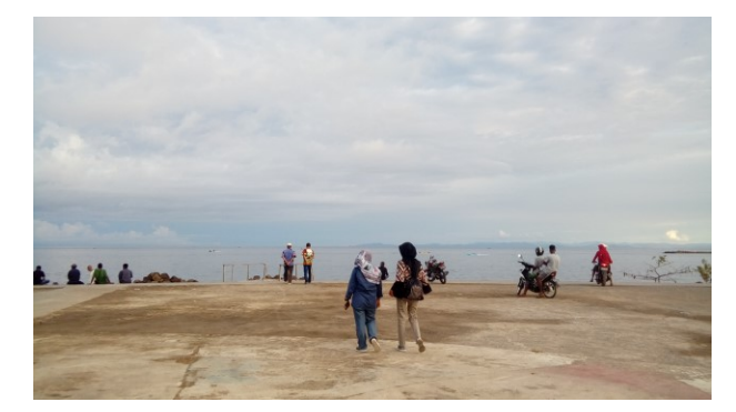
Figure 1. Waisai Torang Cinta Beach (WTC)

encountered in the Waisai district concerning the development of Raja Ampat tourism. These problems can be seen in figure 1, 2 and 3 below: