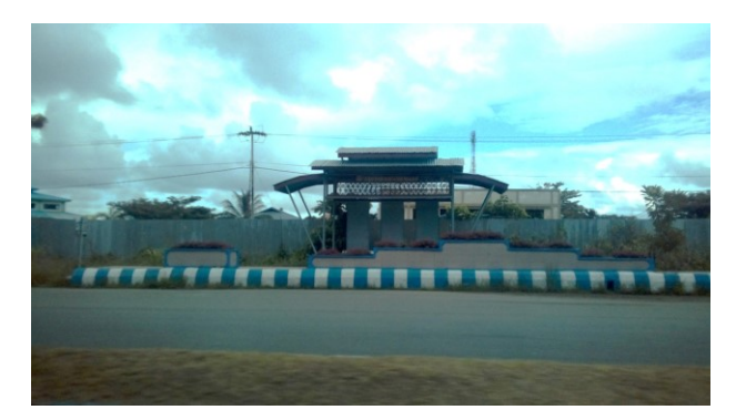
Figure 3. Trans Waisai Bus Stop Note: It has never been used

Figure 2. Raja Ampat Hotel