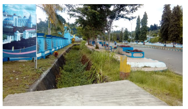
Figure 4. Conditions of dysfunctional waterways

Recent research explains that the problems faced in the development of tourist areas include: imbalance in the distribution of resources and development, inadequate access to tourism sites and imperfect traffic systems (Fu, Chen, Liu, & Han, 2019). Beside those problems, it was also revealed the needs of restaurants, places of worship, cultural promotion, signage, souvenir shops were also needed in the development of tourist areas (Ginting & Sasmita, 2018). This paper investigates spatial problems in which from the beginning there has been no spatial concept that harmonizes and supports the existence of tourism potential there. The most pressing problems at the macro level require priority attention as well as an initial idea to develop the Waisai district in the future.