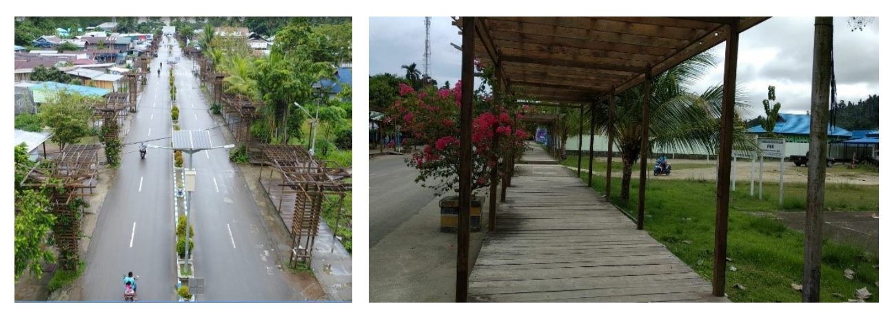
Figure 8. Pedestrian Ways in Fundar Sakela Road

Pedestrian ways on Fundar Sakela Road use wooden board floor finishing with pergola variations on its vertical side. In addition, there are wooden sculptures called "super tree" (Figure 9). Super Tree is intended to "create" trees in a short period of time by growing vines in the sculpture so that over time the plants will reach the entire sculpture and seem like a tree. Unfortunately, almost all of these concepts were not successfully applied, due to a lack maintenance. This was also due to too many super trees being made, thus the maintenance became impractical and the trees were neglected.