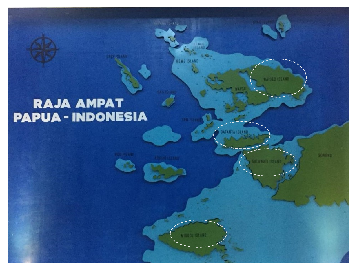
Figure 10. Raja Ampat Region Map

The history of Raja Ampat based on the social believe was started from seven eggs that were hatched into four kings, and two eggs that were hatched into princesses, stone, and 1 last egg that was not found/lost. The history is interpreted and possibly used as initial ideas in various designs. One of them emerges in the idea of a statue design that can be used for Waisai's identity, Raja Ampat.