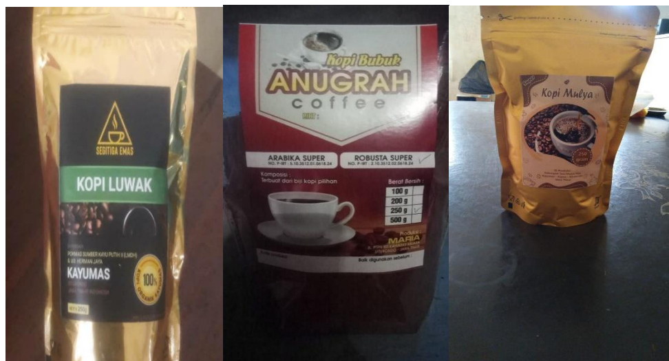
Figure 3. Coffee Products from Kayumas Village Farmers in 2018