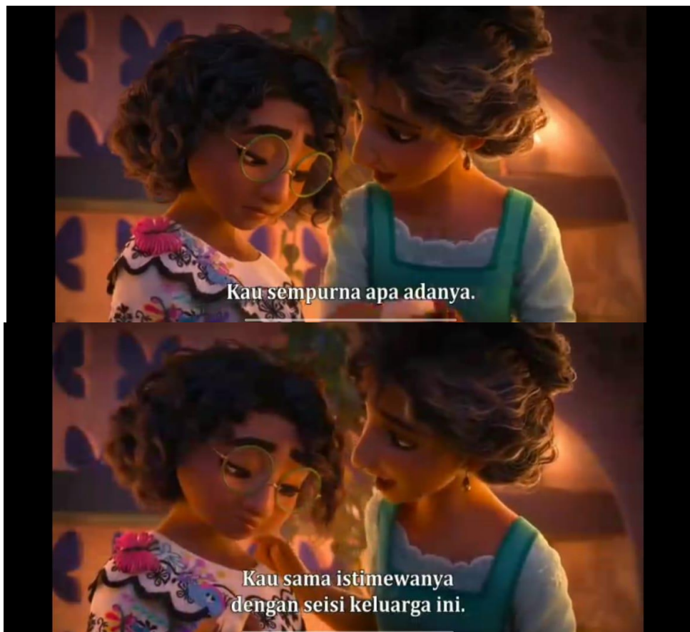
Figure 11. Picture of Mirabel's Mother being wise to her daughter

Her mother Mirabel has a wild old man character because she has always been wise in the Madrigal family. He has positive thoughts about all the family members, he is also cherished for being able to heal others with the food he makes.