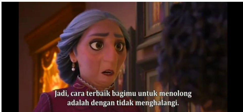
Figure 9. Picture of Madrigal's Grandmother being overprotective

A mother who can give love and a mother can put deep pressure on her child. In this film, Great Mother is shown through a character named Alma who is madrigal's grandmother. She is the head of the Madrigal family. Madrigal's grandmother wants to protect her family because she does not want any more feeling of losing her home but the way she protects it is in the wrong way, she is too overprotective and only looks at those who have the potential for perfection.