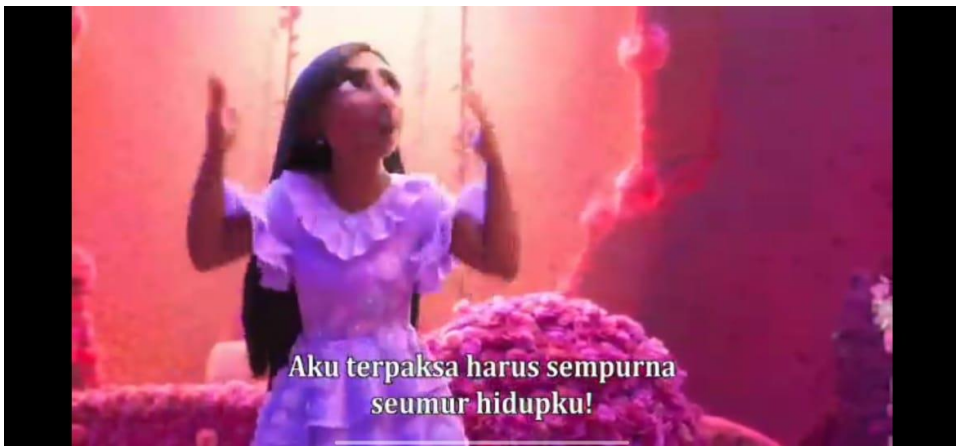
Figure 6. Picture of Madrigal Family's daughter feeling upset about perfectness

Because she is the favorite child in the Madrigal family she is forced to always be perfect to make everything beautiful even though inside she wants to make new interesting things except roses. She wants to create something new, not the same thing over and over again.