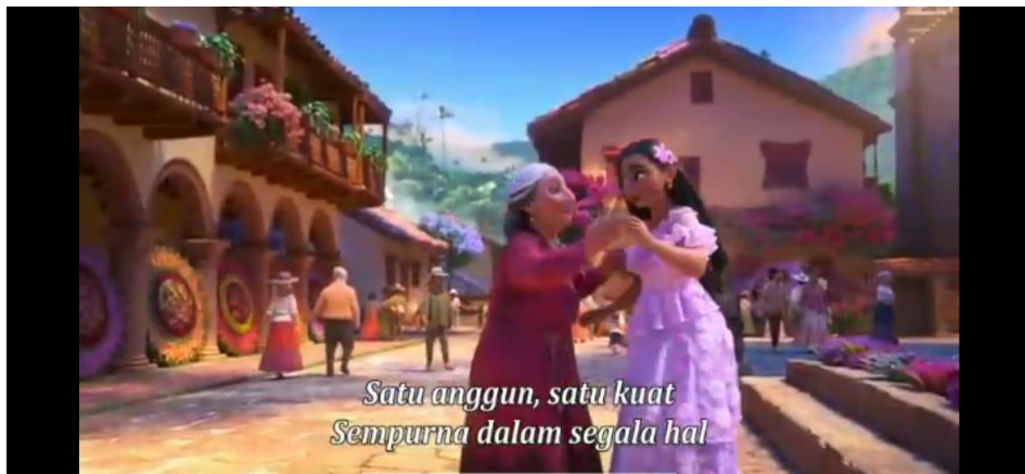
Figure 5. Picture of Madrigal Family thriving for perfectness