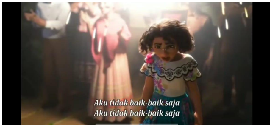
Figure 3. Picture of Mirabel showing that she feels not fine

Mirabel has always shown herself to be fine. Although he can't scan mountains, heal people with food, or create rainbows and storms. She always calms herself by thinking she is still part of the madrigal family, but still, inside she is not fine, she wants to do what makes her family more proud of her.