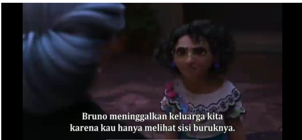
Figure 7. Picture of Bruno's true reason of leaving his family

Archetype shadow in the film Encanto (2021) is shown through a character named Bruno. Bruno is a member of the Madrigal family, but he hides from his family. He does not want to show his bad side to others because many people think that he is a bad influence.