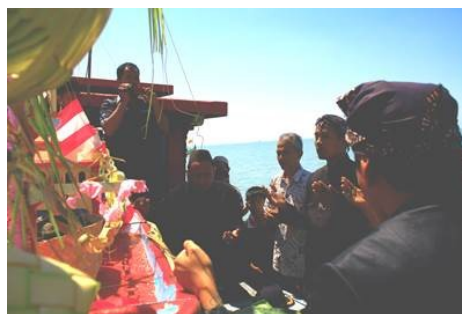
Figure 4. Prayers Together Before the Miniature Ships and Offerings are Released into the Sea

Figure 4 shows the fishing community gathered around the ships and offerings to pray together (in Javanese) before being released into the sea. The essence of the prayer is " mugo-mugo dianakno upacara iki, hasil laut nelayan iso nambah, berkah, lan ora ono alangan opo-opo saben neng laut, mulih selamat gowo hasil akih ", which means that hopefully with the implementation of this Larungan ceremony, the fish catches by fishermen are increasing, blessed, and there are no obstacles in carrying out activities at sea and returning home with lots of fish.