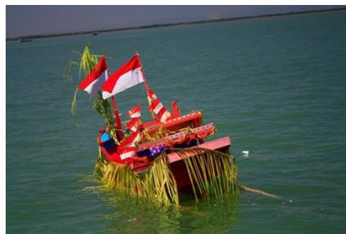
Figure 5. Miniature Ships ( Cukrik ) and Offerings are Released into the Sea

Figure 5 shows the ships and the offerings that have been released into the sea. The release was carried out after the prayer was held together. These cukrik and offerings are presented by the people of Bendar Village as gratitude so that they can get abundant fish and given protection and safety. When the mother ship (which was carrying cukrik and offerings) arrived in Bendar Village, some people deliberately took the offerings and the