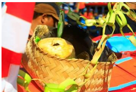
Figure 3. Larungan offerings

Figure 2 explains that the cukrik containing the offerings for the Larungan ceremony are paraded around Bendar Village. The majority of the people of Bendar Village, from children to the elderly attend the Larungan ceremony. In the picture, men are wearing black clothes which are the uniforms of the Committee of Larungan ceremony.