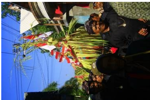
Figure 2. Rituals of Miniature Ship Parade ( Cukrik ) and Larungan Offerings

The process of the Larungan traditional ceremony begins by placing the offerings on a miniature ship, then handing it over to the Village Head, and handing it over to the committee. After that, it is paraded around Bendar Village. The cukrik which has been filled with offerings is then put on the mother ship to be brought out to the sea. When arriving at the sea, joint prayer is carried out and then releases the cukrik and offerings into the sea.